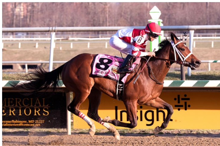
Jenda's Agenda wins the Caesar's Wish going a mile at Laurel Park