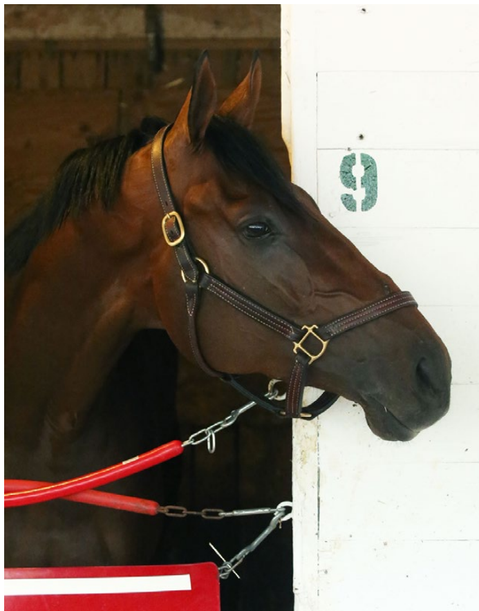
State of Honor at Churchill Downs April 21