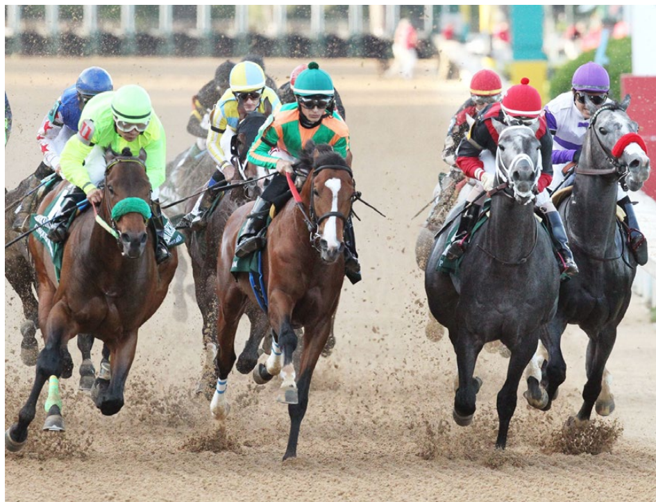
Conquest Mo Money (lime green silks) races early in the Arkansas Derby