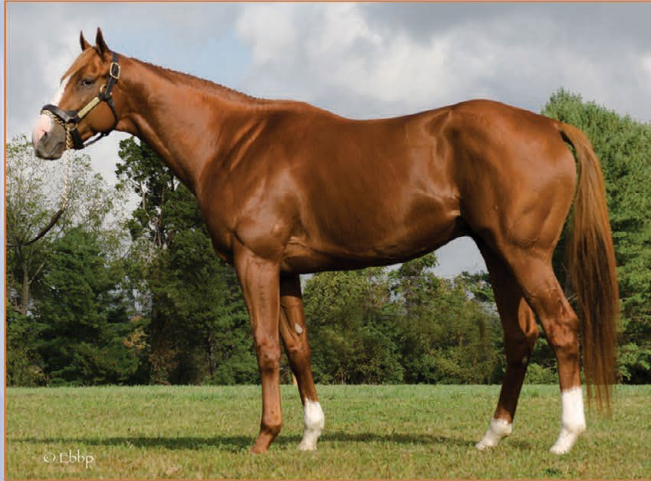
Malibu Moon – Bandstand, by Deputy Minister $3,000 S&N