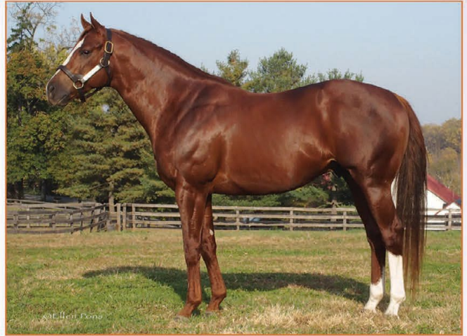
Pulpit – Exogenetic, by Unbridled's Song $4,000 S&N