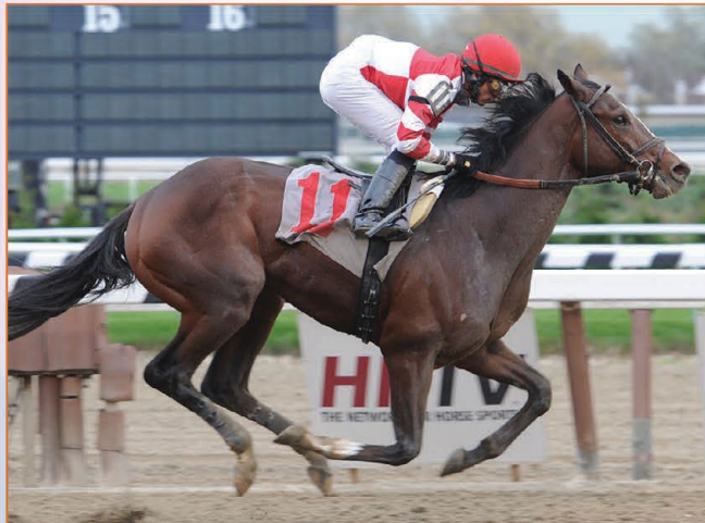
Tapit – Boston Lady, by Boston Harbor $4,000 S&N