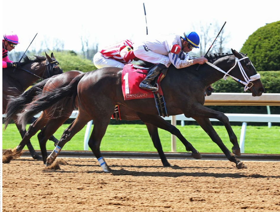
Flat Drunk gets up in the final strides to win her debut at Keeneland