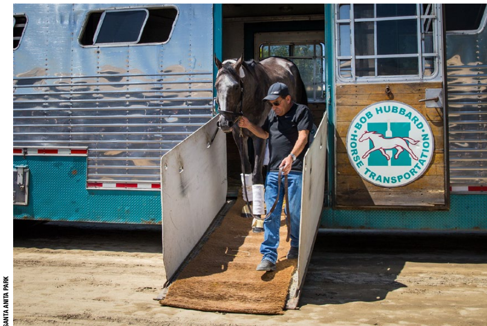
SANTA ANITA PARK

"He's a little fresh," Hall of Fame trainer Bob Baffert said. "We'll back off of him for about 30 days. We'll train him, but he won't breeze for 30 days. He tells us what he wants to do. We'll have to do something with him."