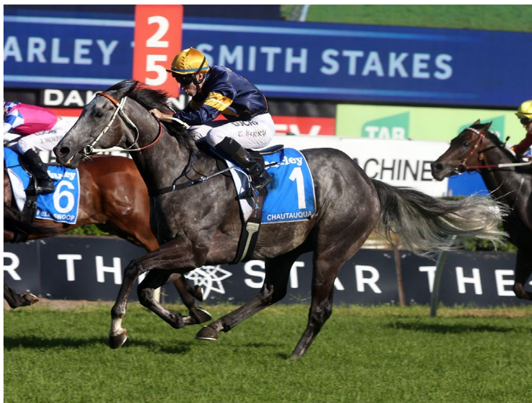
Chautauqua storms home in the TJ Smith Stakes