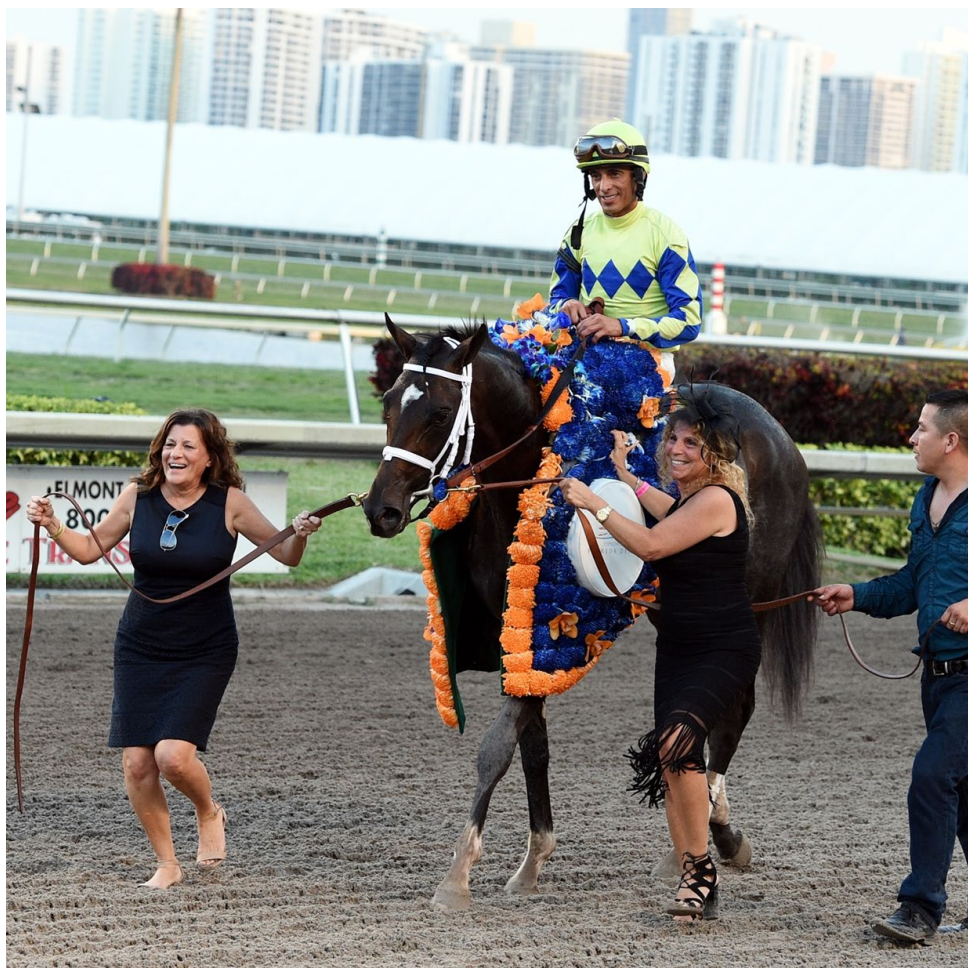
Jubilant connections lead Always Dreaming into the Gulfstream Park winner's circle

Always Dreaming broke his maiden Jan. 25 at Tampa Bay Downs, and followed up March 4 with a 1 1/8-mile optional-claiming allowance win at Gulfstream that served as his prep for the Florida