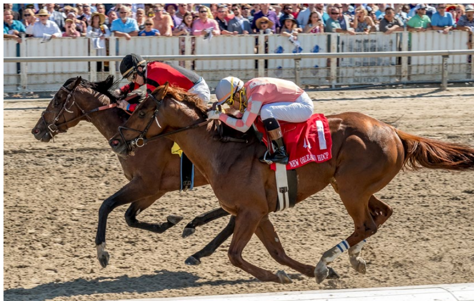
Honorable Duty catches Breaking Lucky to win the New Orleans Handicap

but was then off the board in his two tries against stakes company.