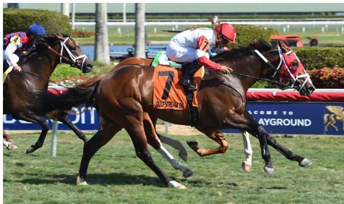
Kitten's Cat takes the Feb. 4 Kitten's Joy Stakes at Gulfstream