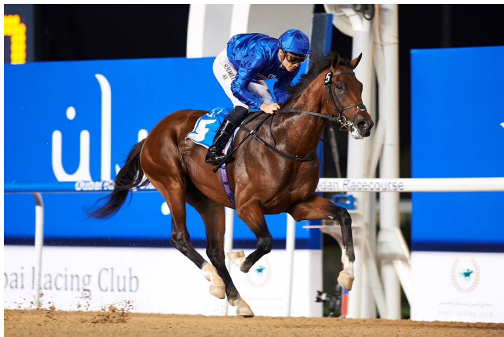
UAE 2000 Guineas winner Thunder Snow