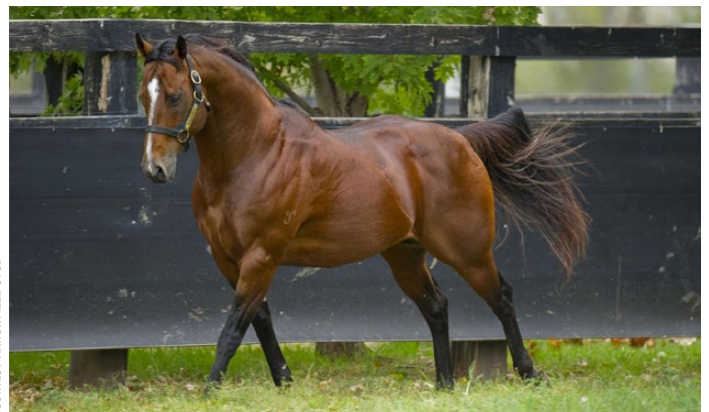
Snitzel romps in his paddock at Arrowfield Stud in Australia