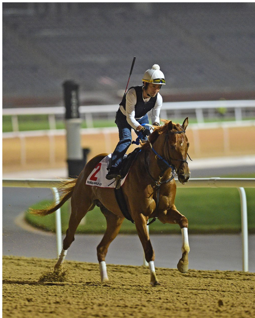
Durable and consistent, Gun Runner chases the biggest victory of his life in Dubai

Arrogate's status as the best handicap horse