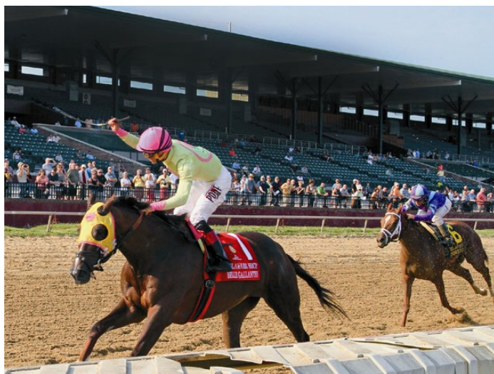
CHAD D. HARMON

According to the Pegasus website, of the 45 horses sold or entered in the previous two sales, 43 (95.5%) have started, with 38 winners (88.3% of starters), through Dec. 31. Of that group, there have been a total of six stakes winners and sale horses who combined have won more than 125 races and earned more than $3.2 million.