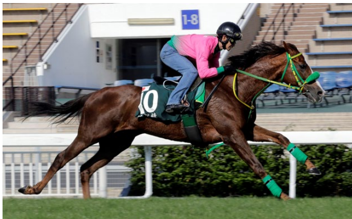
HONG KONG JOCKEY CLUB