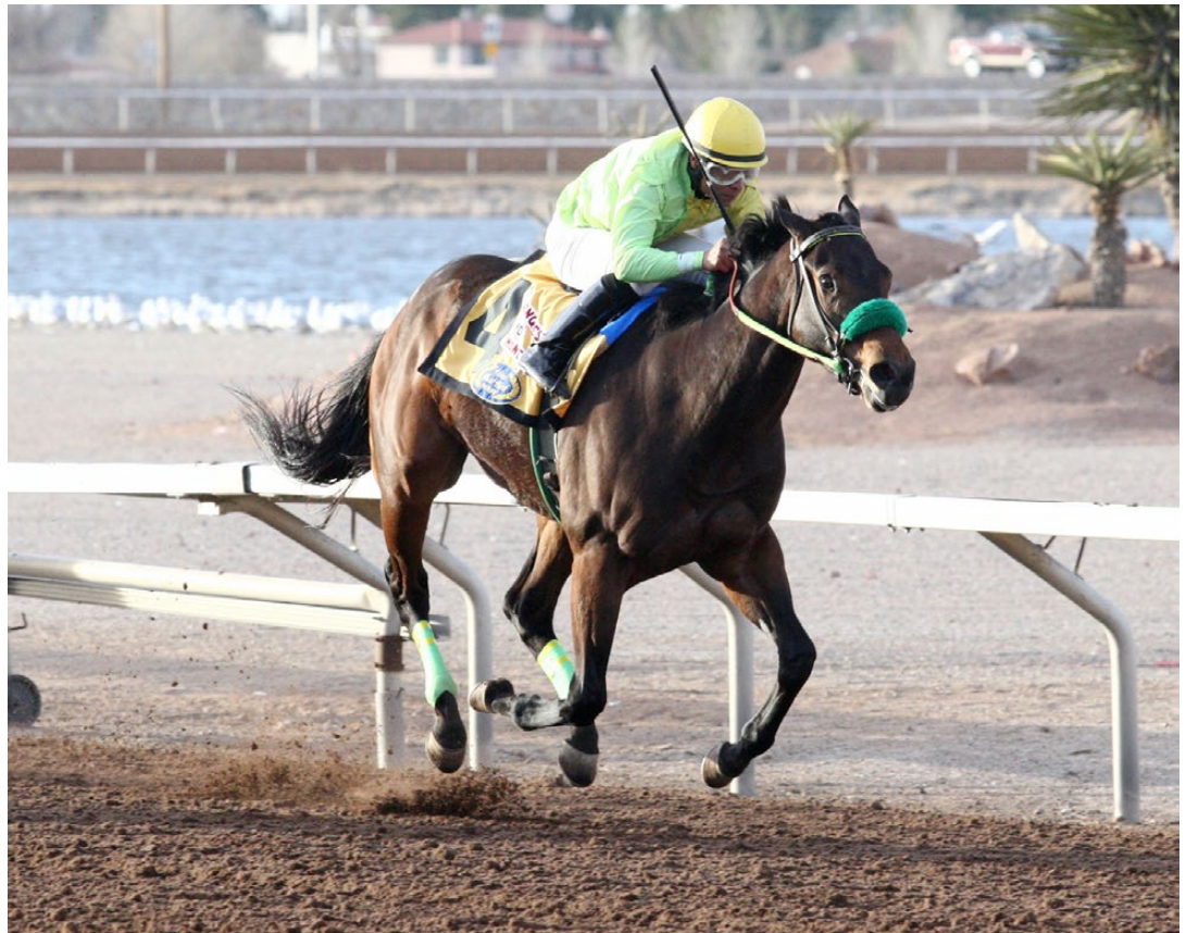
Undeclared Conquest Mo Money wins the Feb. 26 Mine That Bird at Sunland Park

According to BloodHorse data, prior to the dispersal 64 different Conquest starters had 81 wins