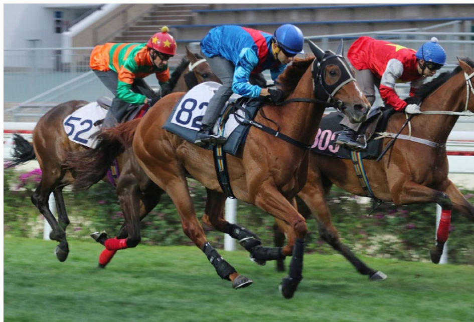
HONG KONG JOCKEY CLUB

Rapper Dragon is among six Derby contenders under Moore's