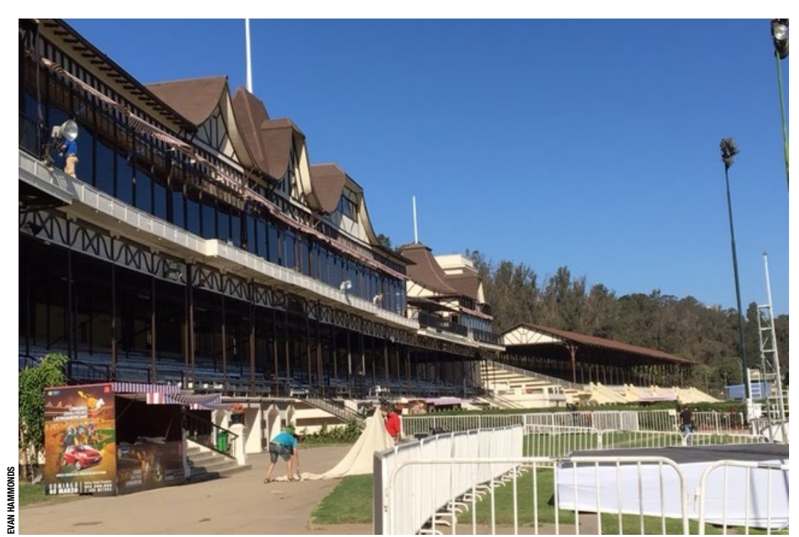
Valparaiso Sporting Club in Vina Del Mar, Chile

The long-range goal of the OSAF is to one day have horses ship south for races such as the Latinoamericano. Next year's running will take place at Maroñas in Uruguay. BH