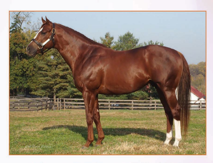
Pulpit - Exogenetic, by Unbridled's Song $4,000 S&N