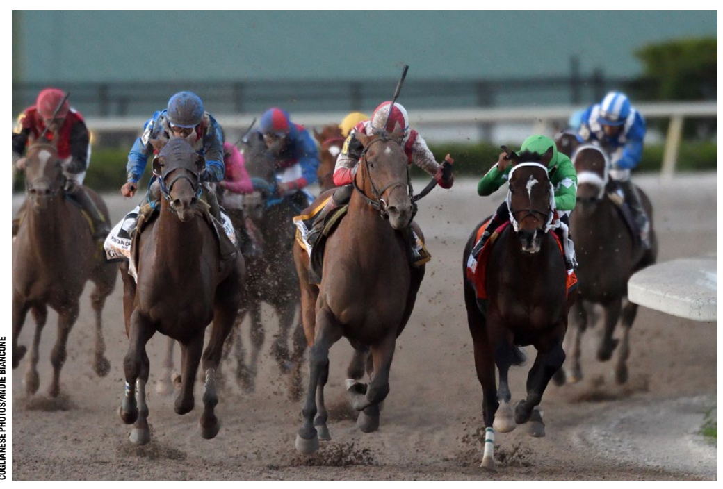
Gunnevera (blinkers) made a last-to-first move to take the March 4 Fountain of Youth