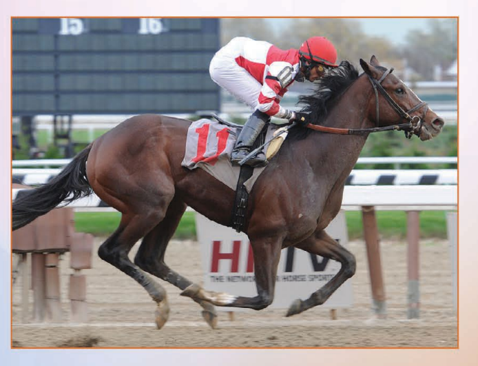
Tapit - Boston Lady, by Boston Harbor $4,000 S&N