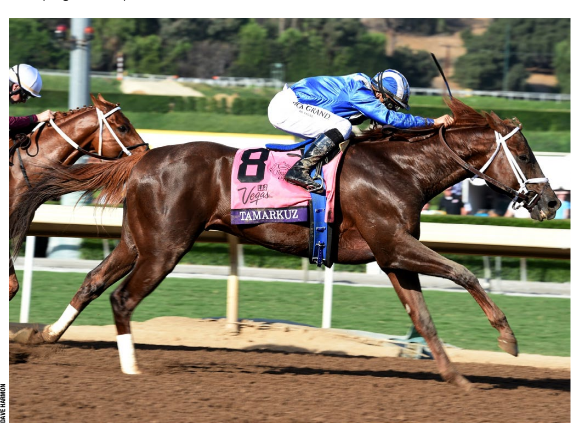
Tamarkuz wins the 2016 Breeders' Cup Dirt Mile