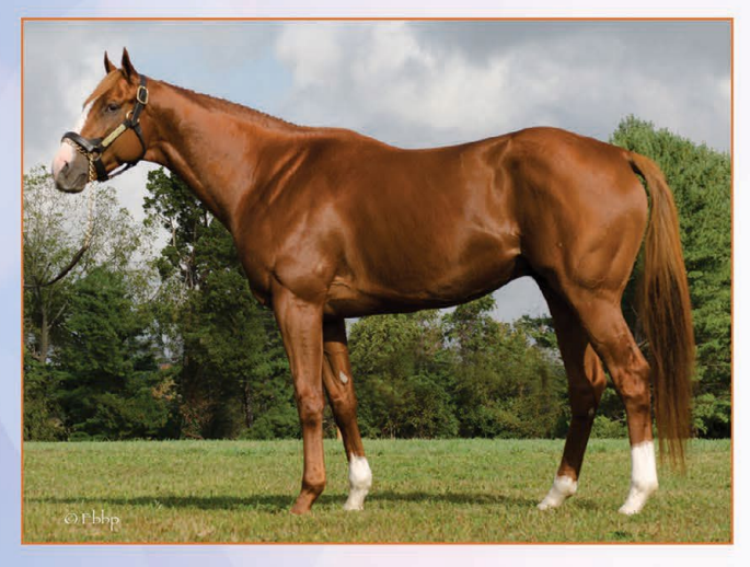
Malibu Moon - Bandstand, by Deputy Minister $3,000 S&N