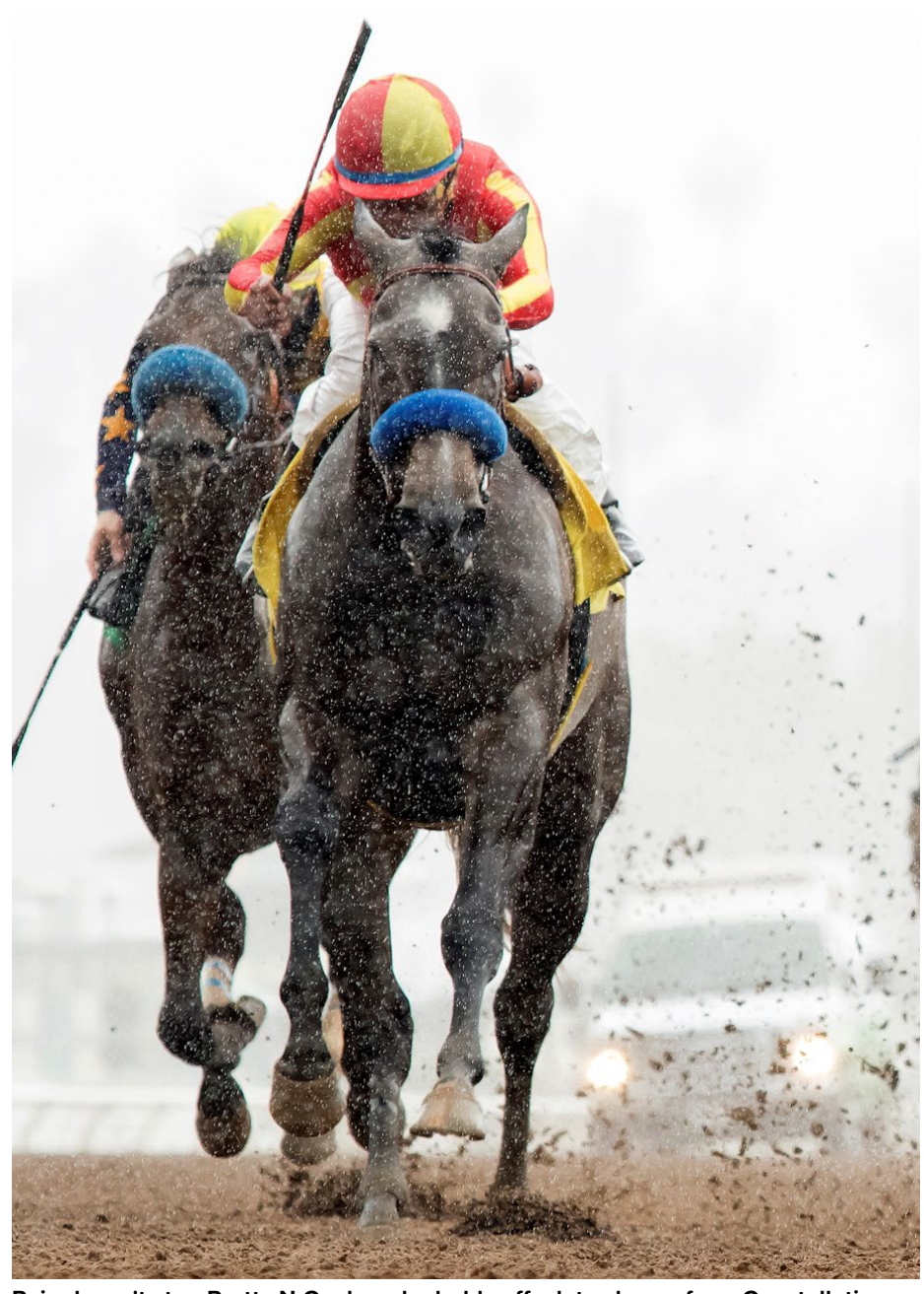
Rain doesn't stop Pretty N Cool as she holds off a late charge from Constellation to win the Las Flores

Ponder Lea passed Sensitively late for third and