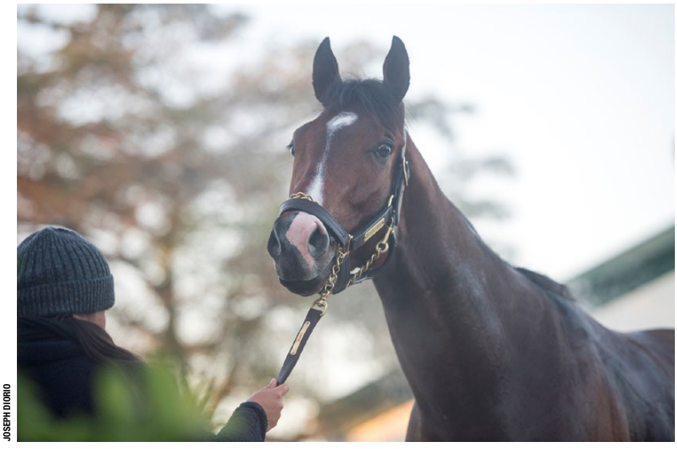
Classic Empire at Palm Meadows