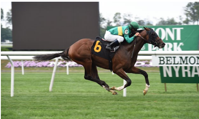
Ticonderoga breaks his maiden at Belmont Park