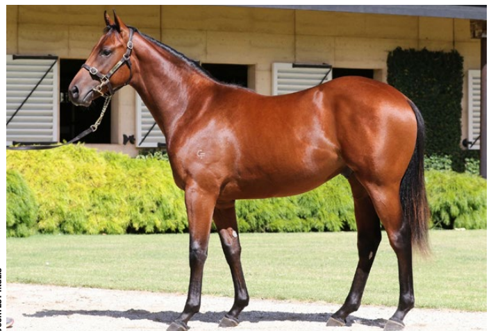
Lot 259, a colt by I Am Invincible out of Soorena