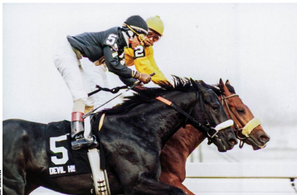
Devil His Due (#5) and Lure finish in a dead heat in the 1992 Gotham Stakes