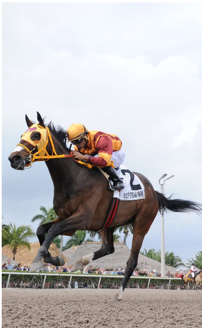
Curlin's Approval soars home in the Royal Delta Stakes