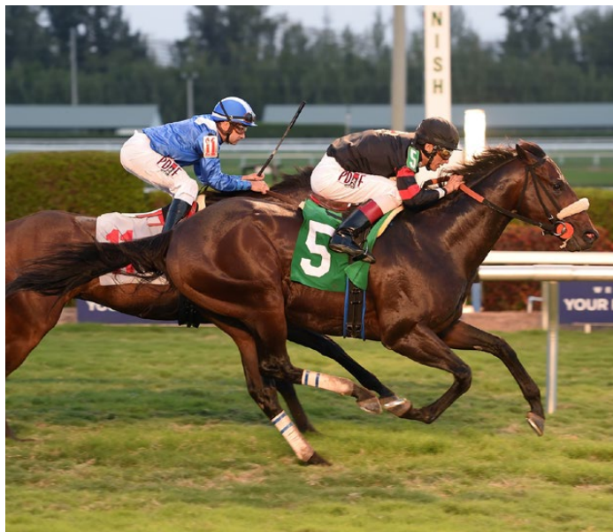
Delta Prince edges pacesetter Alasaal by half a length to win at Gulfstream Park