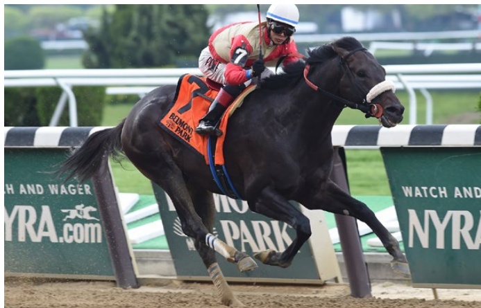
Unified has won two graded stakes, including the grade 2 Peter Pan

Unified was bred in Kentucky by Blue Devil Racing. Stakes-placed Union City is a full sister to the