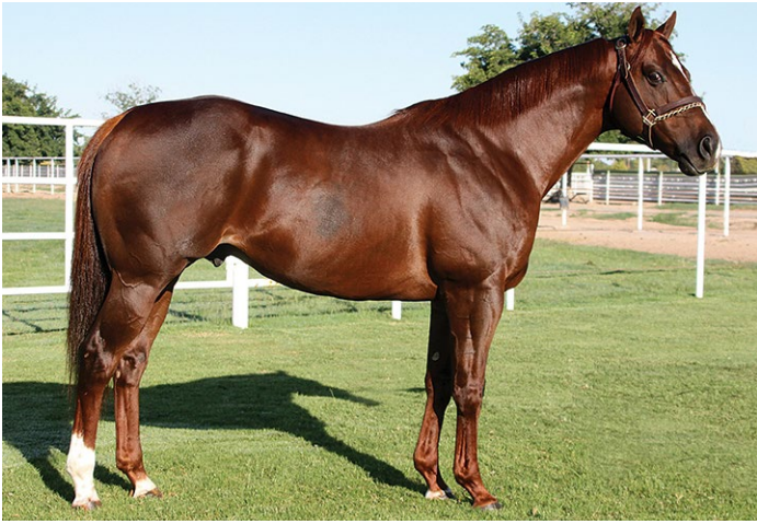
Southwestern Heat at A & A Ranch in New Mexico, finished 2016 as the state's third leading sire