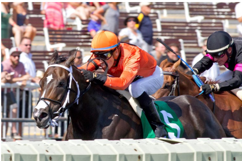
FOUR FOOTED PHOTOS

The schedule includes seven stakes races designated as grade 2 events, 12 grade 3 stakes races, and one listed contest. Thirteen are scheduled to be run over the Matt Winn Turf Course. BH