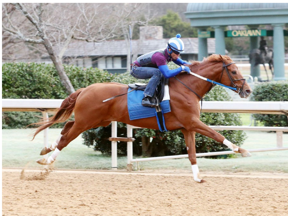
Gun Runner works a bullet five furlongs Feb. 13