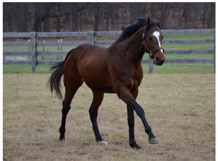
Suns Out Guns Out retired to Hand Ride Stables in Ohio in 2016 where he stood for $2,000