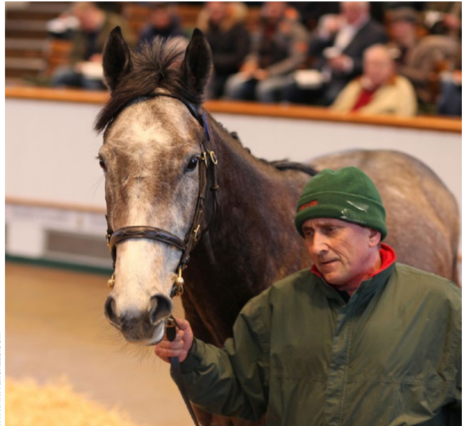
Multiple stakes winner Easton Angel sold for a record-setting 500,000 guineas

The second highest lot of the day was Dressed