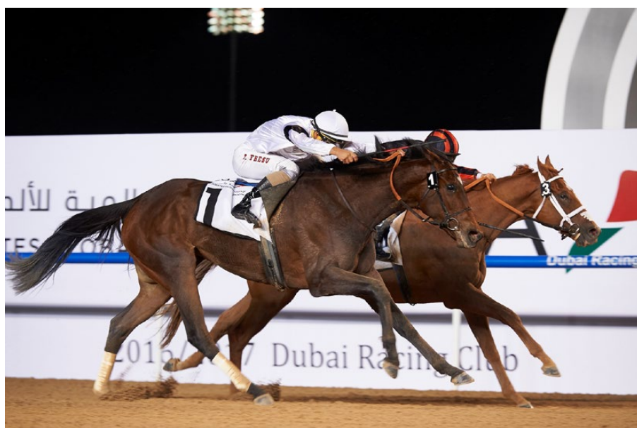
Furia Cruzada (outside) takes the Al Maktoum Challenge Round 2