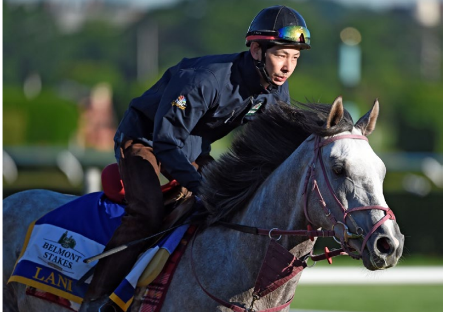
Japan-based Lani finished third in the 2016 Belmont Stakes Presented by NYRA Bets