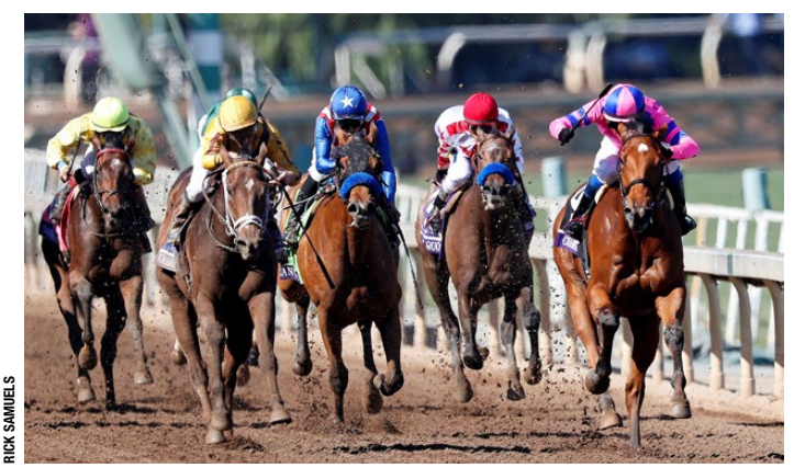
Valadorna (yellow cap) missed the 14 Hands Winery Breeders' Cup Juvenile Fillies by three-quarters of a length to Champagne Room (inside)

Casse's other leading Kentucky Oaks hopeful, grade