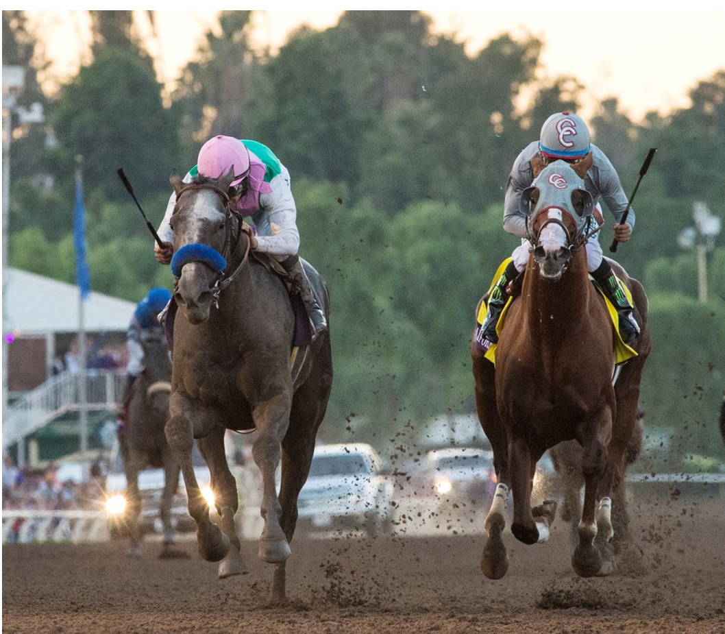
Arrogate and California Chrome are the North American leaders for earnings in 2016