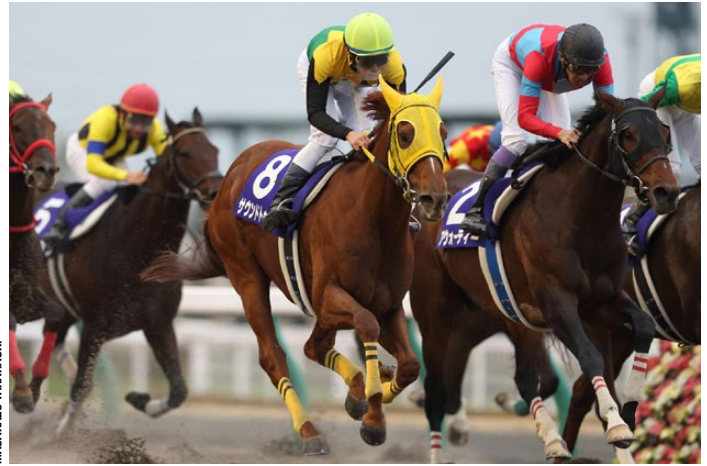
Sound True (#8) gets up to win over favored Awardee (#2) in the Champions Cup

The 6-year-old French Deputy gelding picked up momentum and shot past the leaders getting up in the final strides to win by a neck.