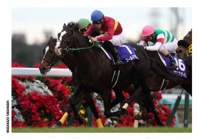
Japanese racing traditionally ended the year with the grade I Arima Kinen

Both the Feb. 26 Nakayama Kinen (Jpn-II) run at 1,800 meters (about 11/8 miles) at Nakayama and the March 11 Kinko Sho (Jpn-II) over 2,000 meters at Chukyo were appointed as "Win and You're In" races for the newly upgraded Osaka Hai. The Kinko Sho had previously been run in December.