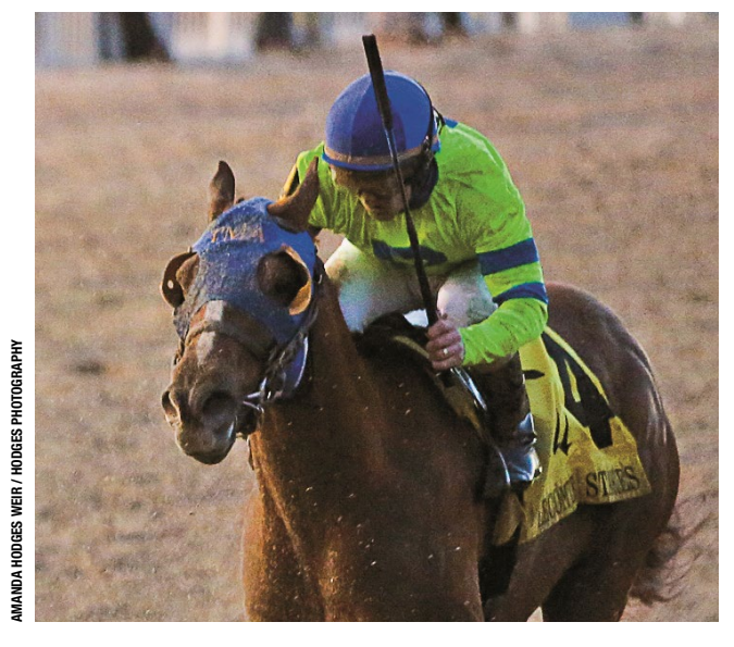
War Story, half to Land Over Sea, out of Jack Swain's mare Belle Watling

JS: With each generation we learn a little