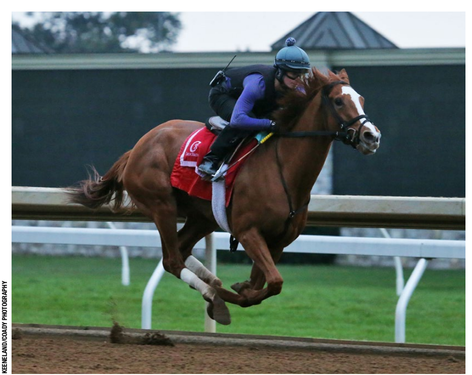
Catch a Glimpse breezes four furlongs on dirt in :49 2/5 on the dirt at Keeneland