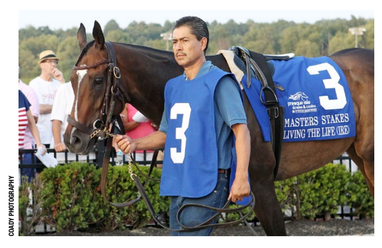
Living The Life

She won the Presque Isle Downs Masters Stakes (gr. II) twice and just missed a third straight in her final start, when she ran second despite a troubled trip Sept. 19 at Presque Isle Downs. A synthetic-track standout, she also won the May 30 All American Stakes (gr. III) against males at Golden Gate Fields and earned a grade I