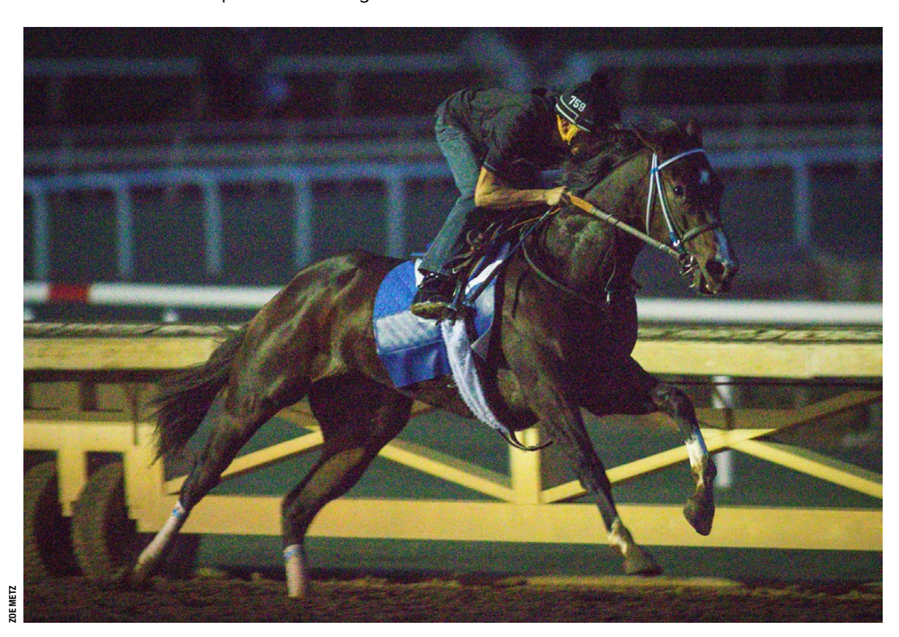
In the early morning darkness Songbird works five furlongs in 1:01 flat

"What we wanted—very nice. I said last week, that was the big work," Mandella said of Beholder's :59 1/5, five-furlong drill Oct. 20. "This was meant to be a tune-up. Looked really good." BH