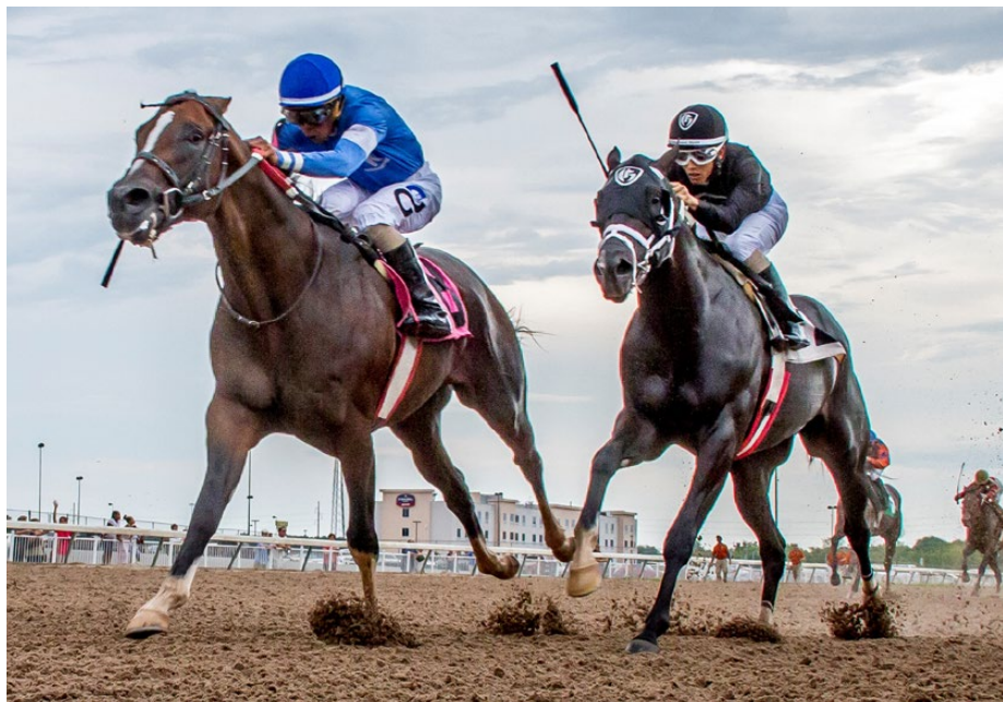
Texas Chrome winning the Super Derby Prelude Stakes