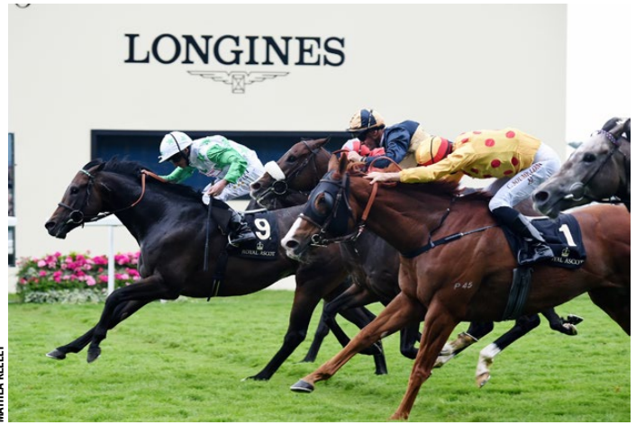
Twilight Son winning the Diamond Jubilee Stakes at Royal Ascot this June