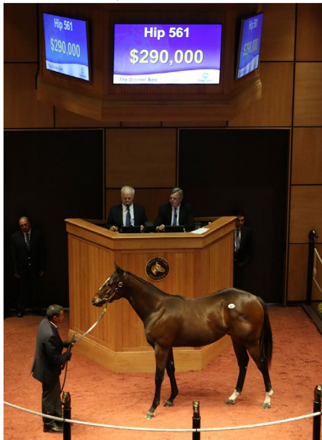
After the Orb colt (cover), the day's second-highest price of $290,000 was for a colt by Gemologist

One area of improvement was the RNA rate with