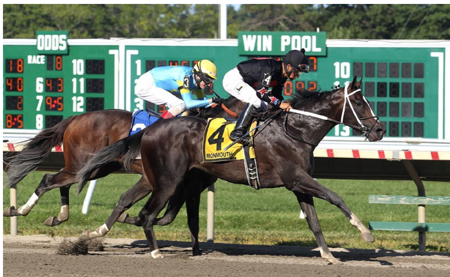
Tip Tap Tapizar wins the Sept. 4 Sapling Stakes by a neck over Holiday Bonus

Gainesway's Tapizar, by Tapit out of Winning Call