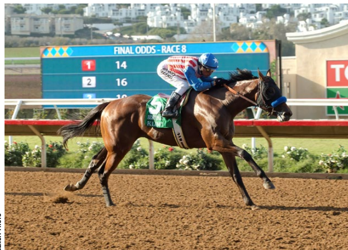
Klimt winning the Aug. 13 Best Pal, bringing his record to two wins and one second from three starts

Completing the line-up are stylish debut winner Midnight Pleasure, and maidens Vegas Itch and Dynamic Ruler. BH