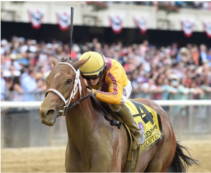
Ogden Phipps winner Cavorting is the morning-line favorite for the Personal Ensign