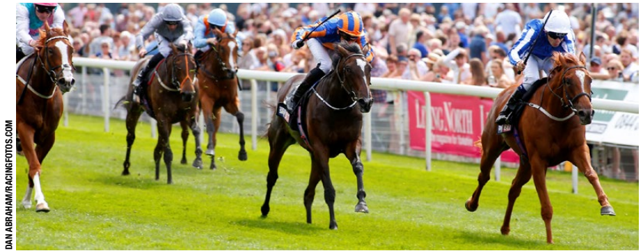
Queen Kindly (white cap) winning the Sky Bet Lowther Stakes at York