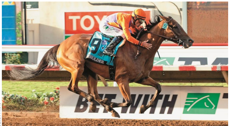
Beholder wins 2015 Pacific Classic

The past four Challenge winners all were bred in Ireland, a stretch starting with Mondialiste's Arlington Million Stakes (gr. I) win, followed by Ribchester, Postponed, and Seventh Heaven in Challenge races conducted in Europe. Ireland boasts seven Challenge wins this year. BH