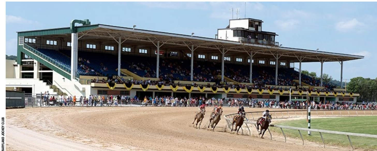
MARYLAND JOCKEY CLUB