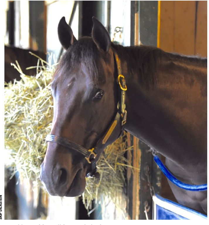
Brooklyn Bobby will be Frankel's first U.S. starter Aug. 6

Blame Will's dam, Be My Prospect, has six winners from seven starters, including stakes winner Cat Burglar (Unbridled's Song). He is from the family of pensioned sire Belong To Me.