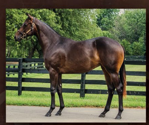
Hip 121 Filly by Awesome Again