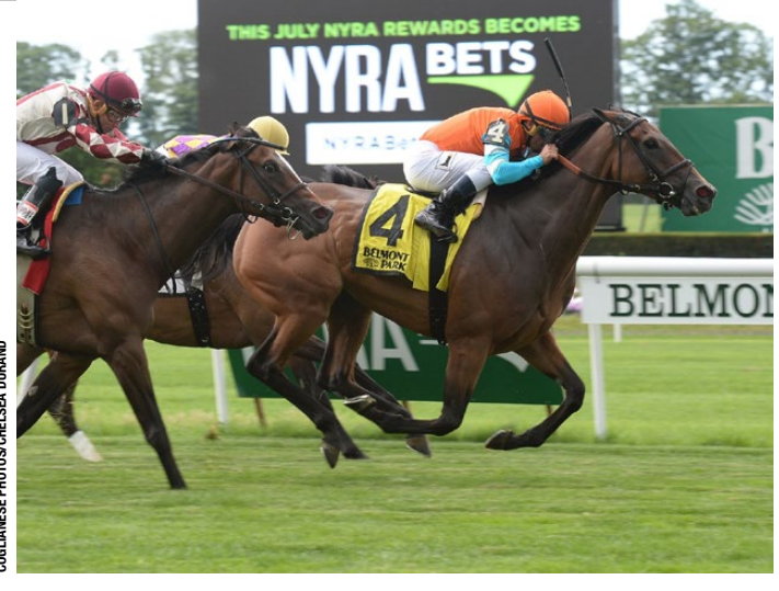
Guapaza broke through over Trophee in the River Memories Stakes