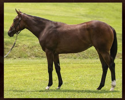
Hip 154 Filly by Stay Thirsty