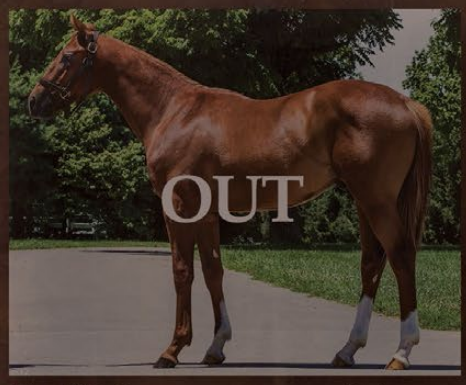
Hip 48 (selling at Fasig-Tipton October) Colt by Union Rags