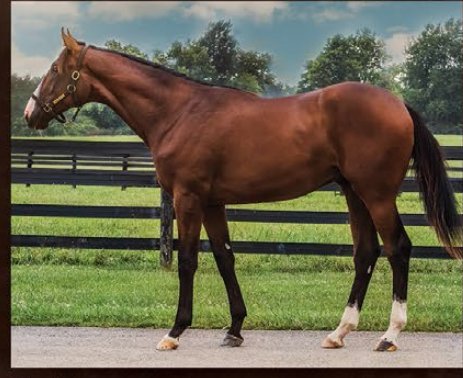
Hip 81 Colt by Pioneerof the Nile