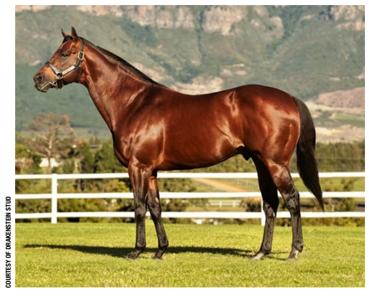
Trippi is now South Africa's leading general sire of the 2015-16 season

Captain Al's 18 individual stakes winners for the season included grade I winning fillies Carry On Alice, Cloth of Cloud, and The Secret Is Out. He is also the