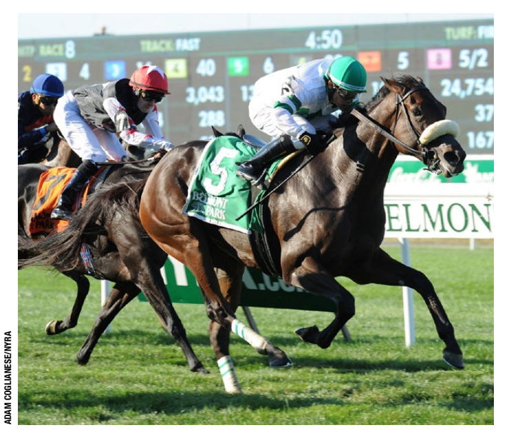
Recepta won the Noble Damsel in 2015 and was second her past two starts in grade I company