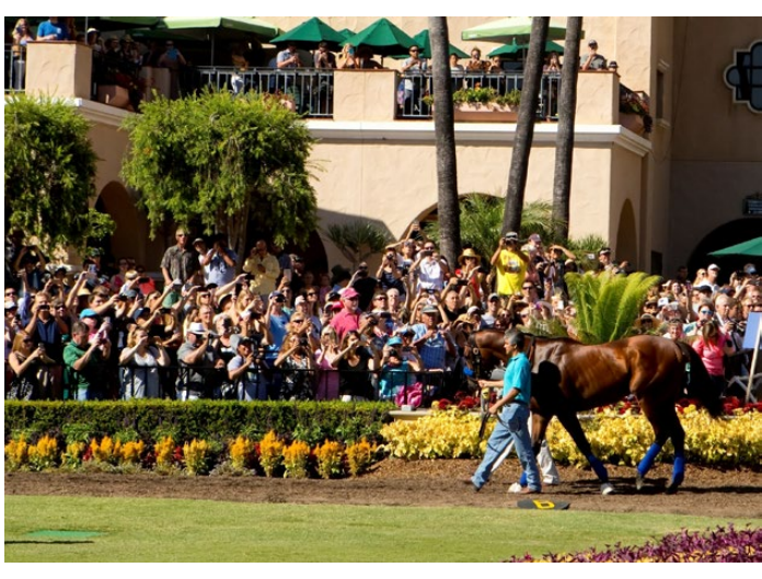
Triple Crown winner American Pharoah paraded at Del Mar, but did not race there as a 3-year-old