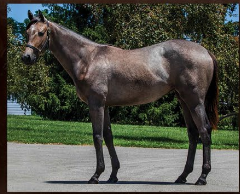
Hip 180 Filly by Shackleford