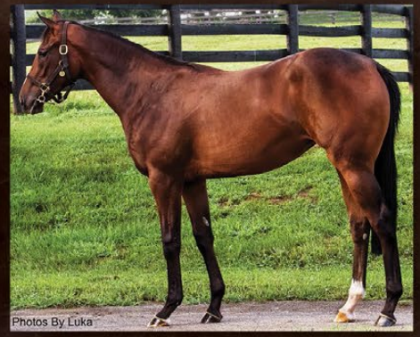
Hip 82 Filly by The Factor