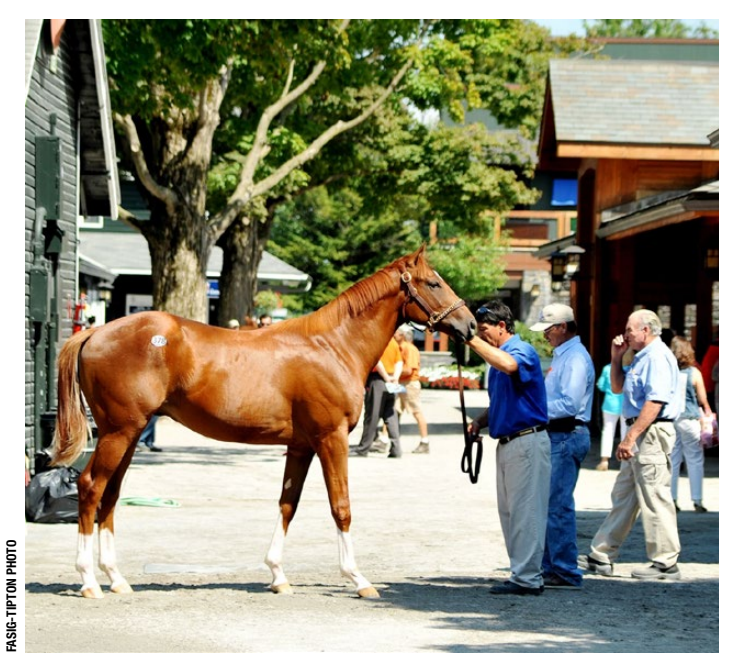
Prospective buyers inspect a Saratoga sale yearling

Bred by Three Chimneys, the colt was produced from Aubby K, a grade I-winning daughter of Street Sense who sold for $2.4 million at last year's