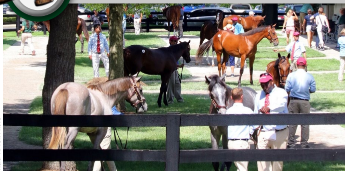
Prospective buyers inspect yearlings prior to Fasig-Tipton's July sale