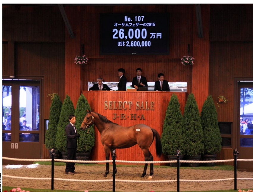
Hip 107, a colt by Deep Impact out of Awesome Feather, brought the highest price of US$2,600,000

The JRHA select foal sale is set for July 12. BH