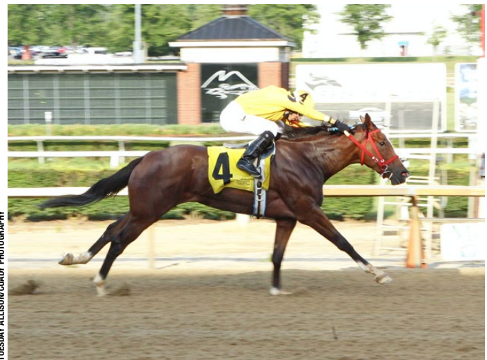
Macy's Attitude wins race 1 at Mountaineer July 11