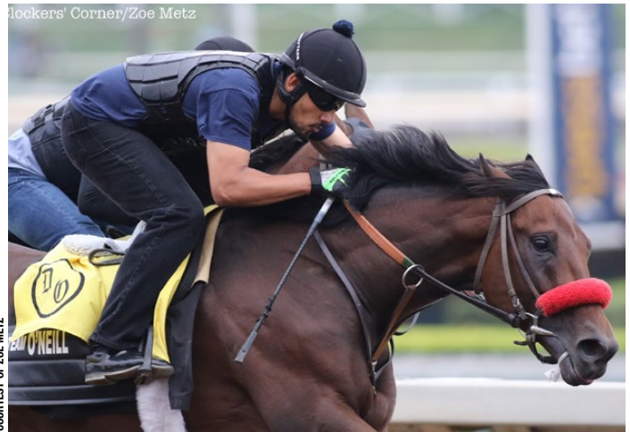
Nyquist works at Santa Anita Park