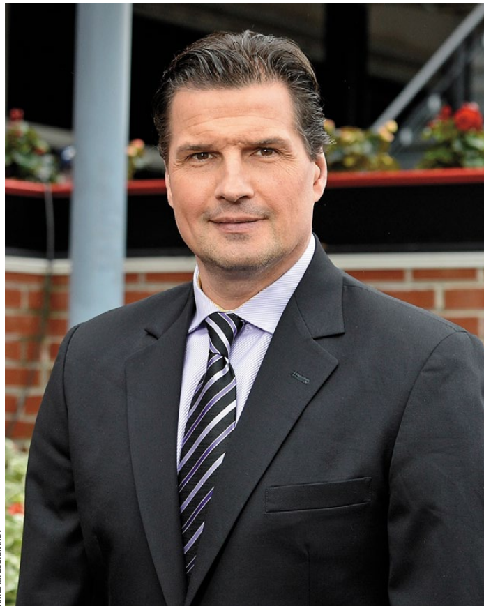
Eddie Olczyk will be the keynote speaker at OwnerView's third Thoroughbred owner conference

"Like Gary Player and Jim Rome, Eddie Olczyk maintains a deep passion for this sport and he will be sharing the perspectives of an owner, fan, and broad-