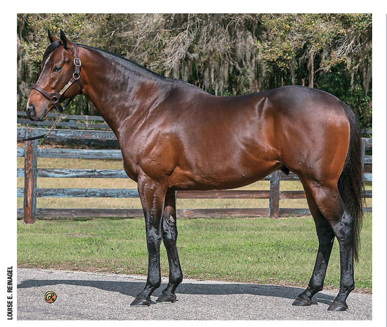
Biondetti stands at Woodford Thoroughbreds in Florida