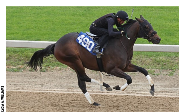
Hip 490, sold for $1 million, is a filly by Uncle Mo out of Dream Street

"I just thought he was a lovely horse," Crupi said. The colt was one of six horses to breeze the eighth-mile