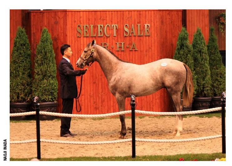
Hip 108, a colt by Tapit out of grade I winner Champagne d'Oro at the 2015 Select Sale in Japan