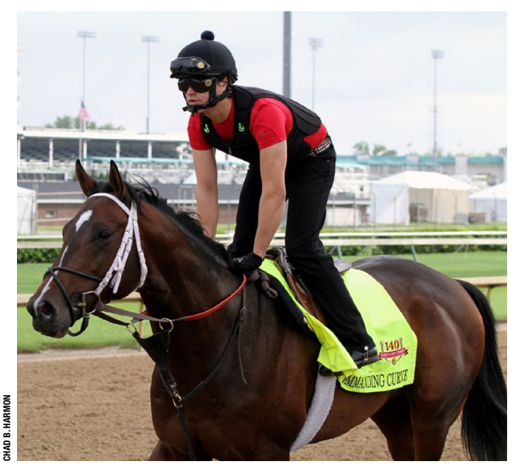
Commanding Curve placed second in the 2014 Kentucky Derby to California Chrome

Commanding Curve broke his maiden in the fall of his 2-year-old season before finishing third in the 2014 Louisiana Derby (gr. II) As a 4-year-old he won