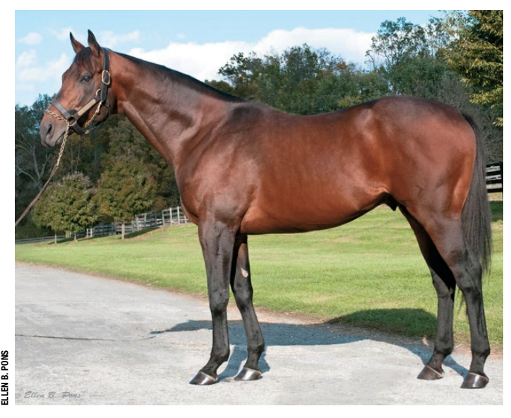
Friesan Fire, by A.P. Indy, stands at Country Life Farm in Maryland for a fee of $4,000

With a high percentage of 2-year-old winners in his first crop, Friesan Fire showed he can improve