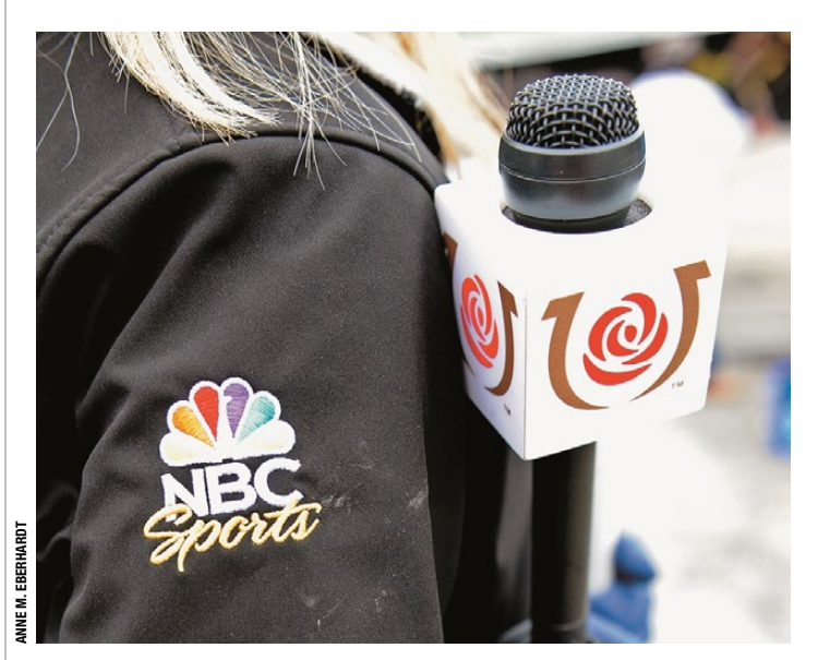
NBC reports overall increases in Preakness viewership

NBC Sports Live Extra also delivered 3.1 million minutes of live streamed coverage of the Preakness—221% more than in 2015—that was seen by a record 115,000 unique users. BH