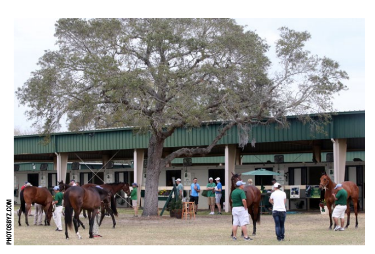
The March OBS 2-year-old in training sale starts March 15 at 11:00am EST watch live on Bloodhorse.com