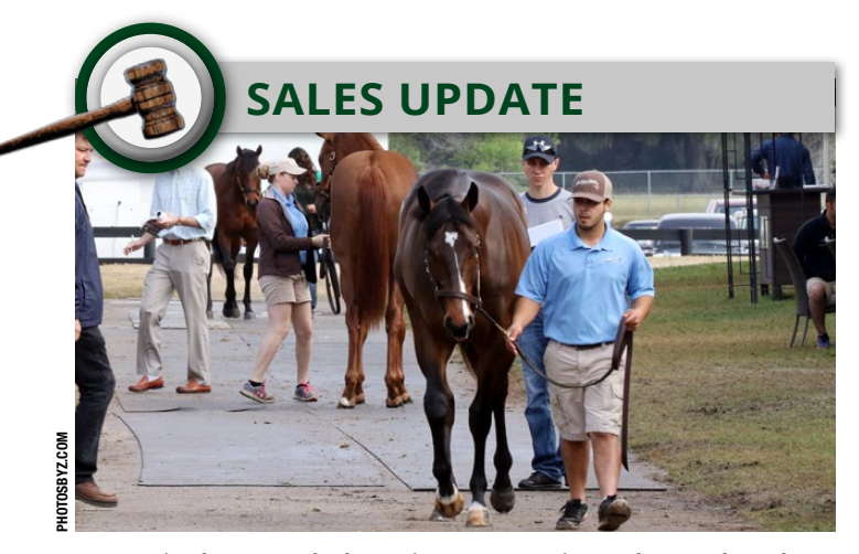
Prospective buyers make last-minute notes prior to the March Ocala Breeders' Sales Co.'s 2-year-olds in training sale