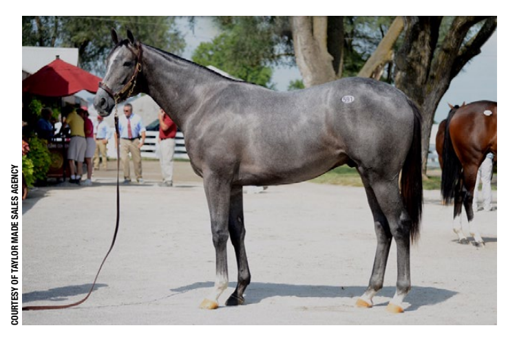
Consigned to the 2014 Keeneland September sale, Destin is now tied for second on the Road to the Kentucky Derby leaderboard with 51 points