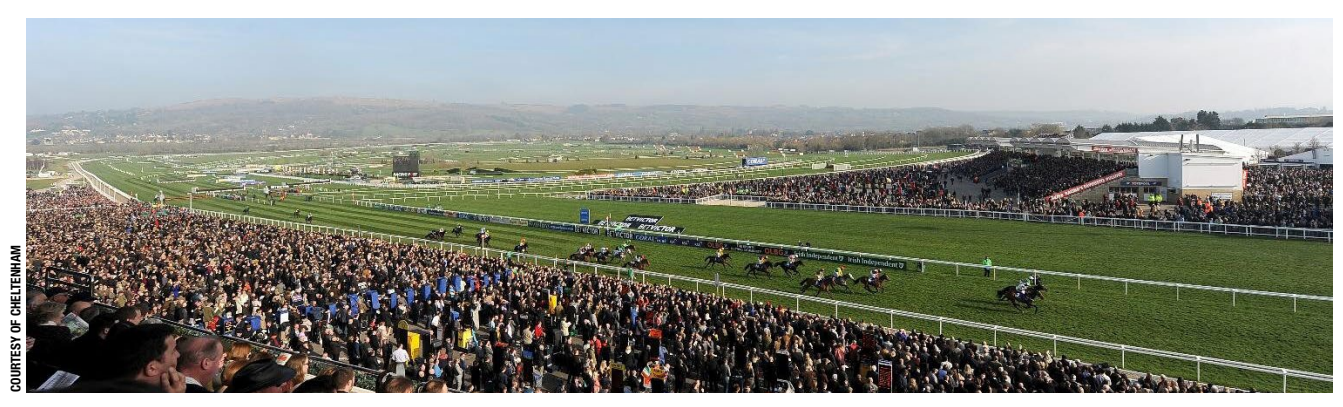
The 2016 Cheltenham Festival will take place over four days starting March 15

But starting March 15 and continuing until March 18, a quarter million pilgrims will pay dearly for the privilege of attending the Cheltenham Festival. They won't hear any labored breathing as the horses approach the final fence. That sound will be overwhelmed by ardent cheering for the bravest horses anyone could ever hope to see. BH