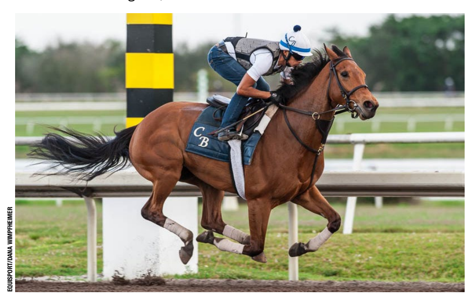
Lady Eli has completed three timed workouts since her Feb. 29 return to training and is showing continuous improvement.

Lady Eli has won six starts and $1,449,800, including victories in the Belmont Oaks Invitational Stakes and Breeders' Cup Juvenile Fillies Turf (both gr. IT). BH