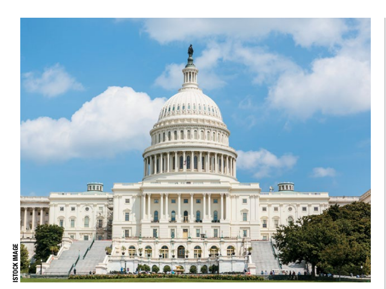
A bill that would grant the United States Anti-Doping Agency authority over equine medication policy, testing, and enforcement has gained support from sponsors