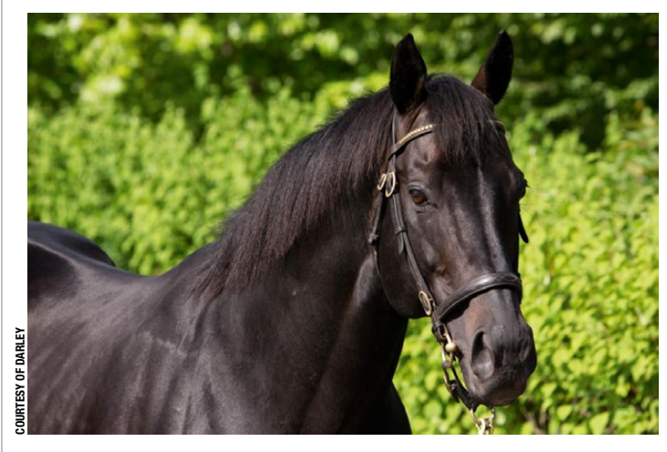
Cape Cross is currently the leading all-weather sire in England by number of winners

An Irish-bred group I winner, Cape Cross ran almost exclusively at a mile. He was leading sire in France and England in 2009 as well as in the Slovak Republic in 2013. He will certainly be looking for further successes during Finals Day March 25. BH