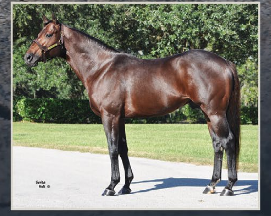
Speightstown - Poised to Pounce, by Smarten Fee: $6,500 LF/SN

Defeated Preakness winner SHACKLEFORD (G1) in the Alfred G. Vanderbilt H-G1 earning a 104 Beyer