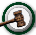
The OBS March sale produced six grade/group I winners in 2015