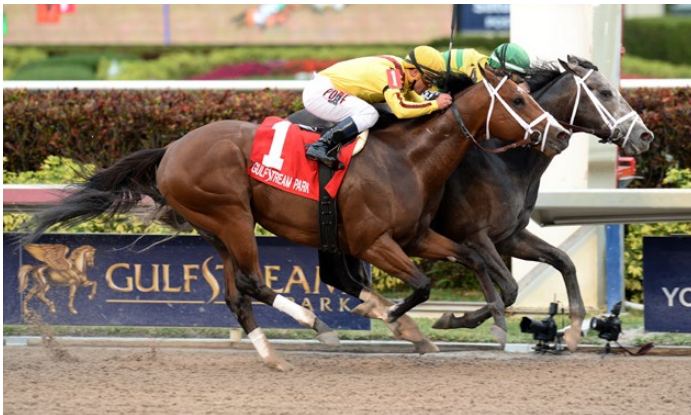
Blofeld (rail) and Stanford earn the week's best Equibase Speed Figures as they fight out the grade II Gulfstream Park Handicap