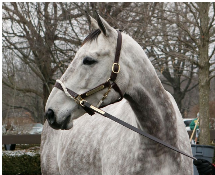
Sale-topper Flashy American is in foal to Orb and will likely be bred back to Tapit