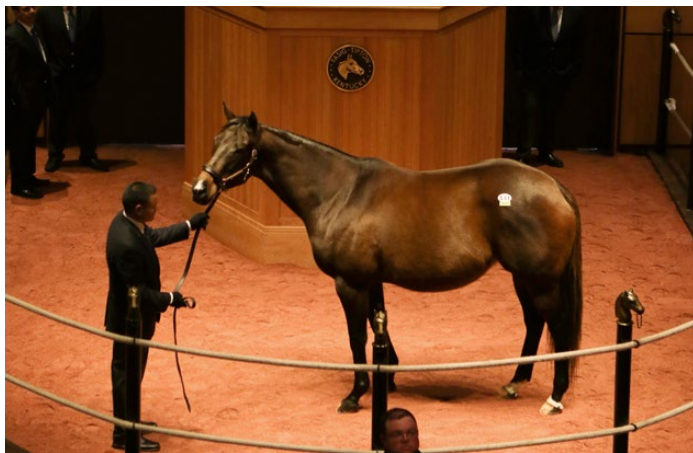
Three mares in foal to Scat Daddy averaged $236,000 at the Fasig-Tipton Kentucky winter mixed sale