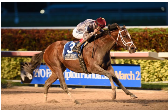
Mshawish winning the Donn Handicap, his first grade I on dirt