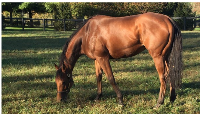
Lady Eli spent some quiet time at Dell Ridge Farm near Lexington as part of her recovery from laminitis